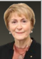
The Hon KG (Kerry) Sanderson AC CVO (from 2 Mar 2021)