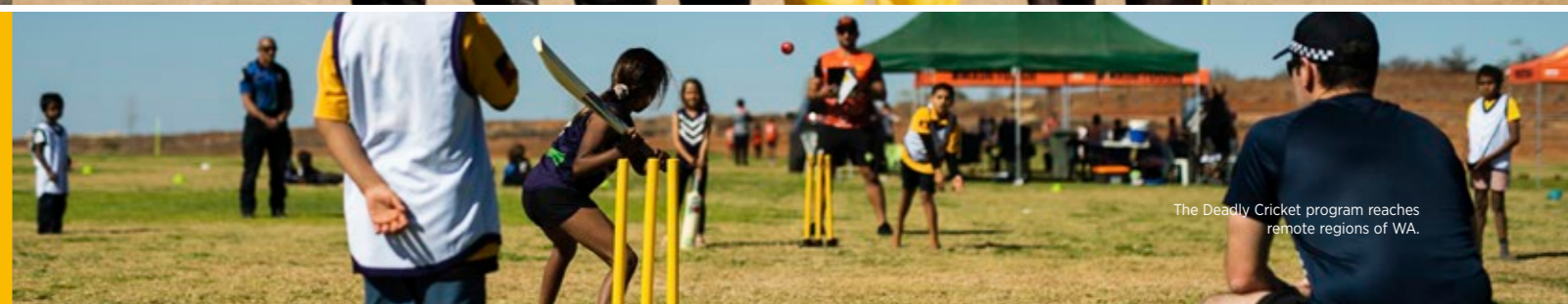
The Deadly Cricket program reaches remote regions of WA.

Throughout the 2020-21 season, WACA staff and the Foundation partners delivered nine diversity and inclusion programs across the State, helping to create equal opportunity for every West Australian to benefit from the sport that we all love.