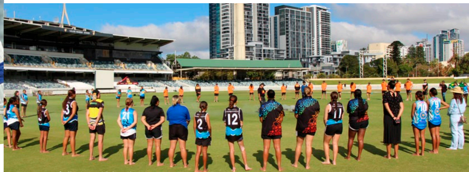
Smoking ceremony at the inaugural Deadly Cricket Carnival.

Funding from the WA Cricket Foundation and the Insurance Commission of WA has provided important support to be able to continue to expand both the Star Blast Program and Integrated Cricket League.