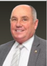
Hon TK (Terrance) Waldron