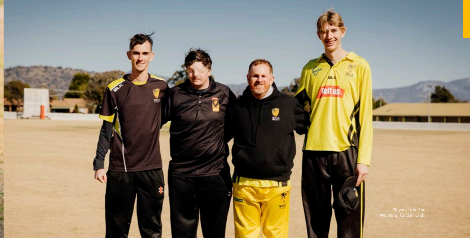
Players from the WA Blind Cricket Club.

The WA Cricket Foundation aims to enrich, support, and inspire communities by delivering social outcomes through cricket.