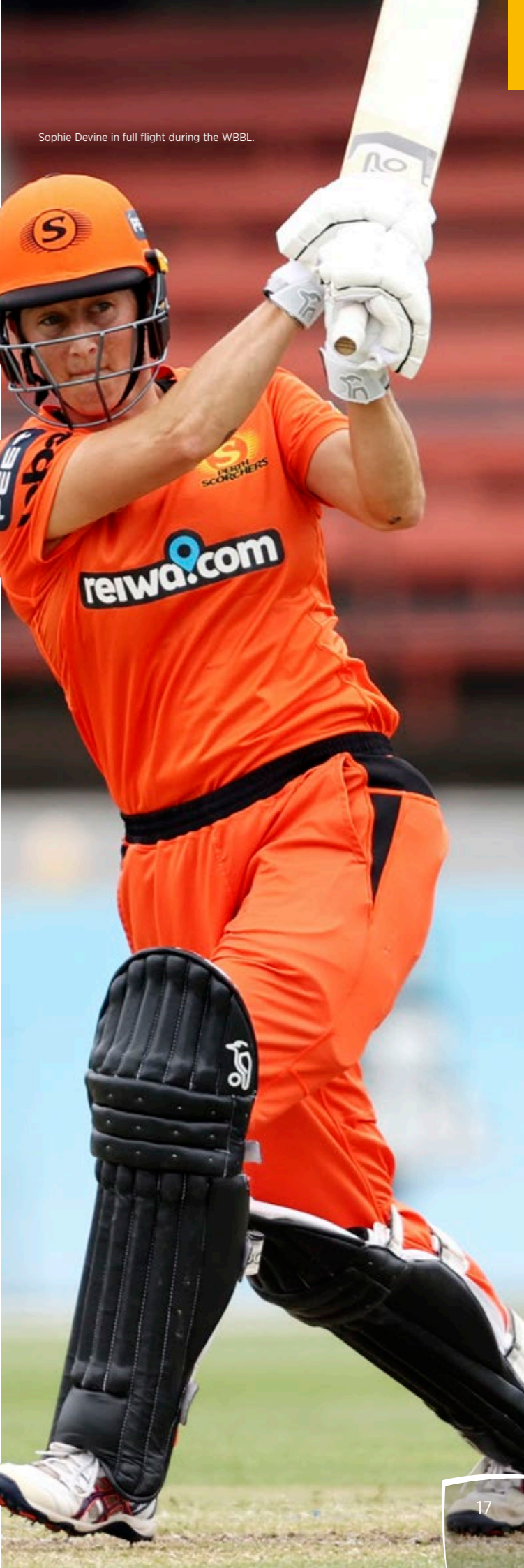
Sophie Devine in full flight during the WBBL.